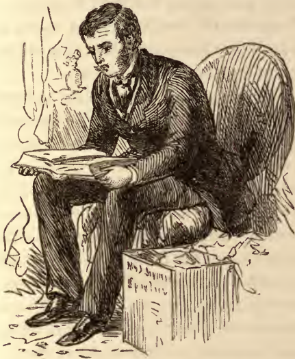
"He found the date of the birth of 'Lillie Ellis.'"

But John, who was curious in the matter of books, sat quietly down in a corner to examine it; and on the middle page, under the head "Family Record," he found, in a large, bold hand, the date of the birth of "Lillie Ellis" in figures of the most uncompromising